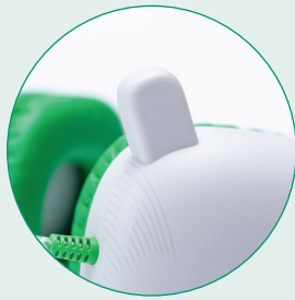
KidCom™ built-in microphone