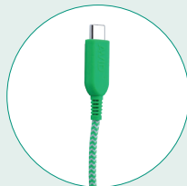
Available with 3.5mm or USB-C connections