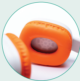
Soft padding and on-ear design